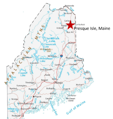
Figure 1. The City of Presque Isle is in rural northeastern Maine on U.S. Route 1.

In 2022, MaineDOT and the City implemented a Village Partnership Initiative agreement. The initiative aims to address key infrastructure challenges along US 1 while enhancing the character and aesthetics of downtown Presque Isle. This Project, born out of the initiative, will provide substantial benefits to local and regional residents, as well as visitors, in order to safely navigate to and through the city regardless of transportation mode and will spur economic development opportunities. The catalyst for the Project is a related US 1 bypass project which will reroute heavy freight traffic around the city. The Presque Isle Freight and Mobility Priority Corridor Project —awarded an FY22 INFRA grant— will create a roadway for trucks to travel around the city, allowing safer and less congested conditions in downtown Presque Isle. This will reduce the need for significant ongoing maintenance necessary due to heavy