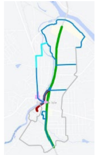
Figure 2. The Project consists of multimodal improvements throughout downtown Presque Isle (details for each component included as Attachment A and here ).